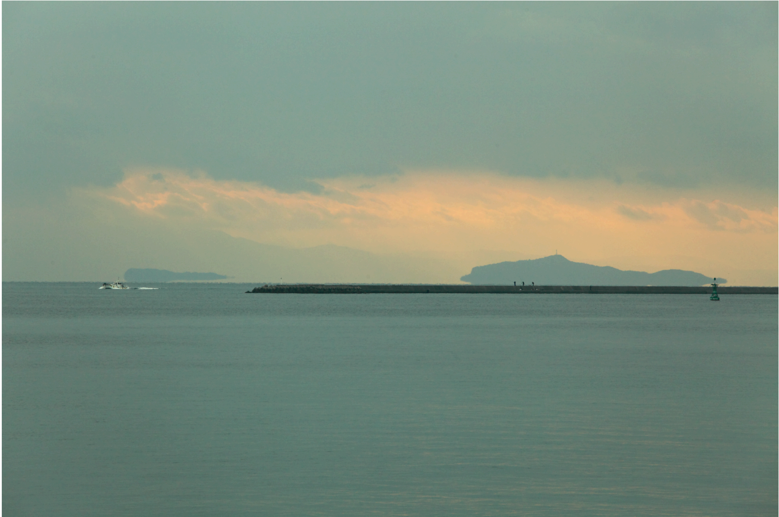
Kagoshima is surrounded by the seas. Pacific Ocean, the East China Sea and Kagoshima bay (called Kinko Bay). Each of them shows us a different view. Kagoshima Bay