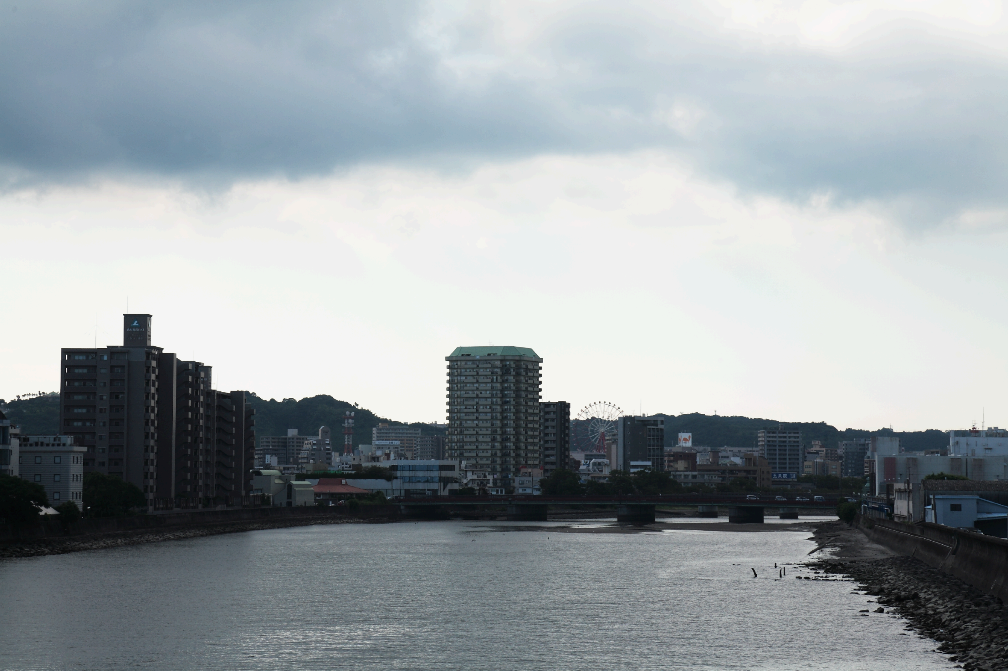
Kagoshima City has a population of about 600,000 and is a port city.