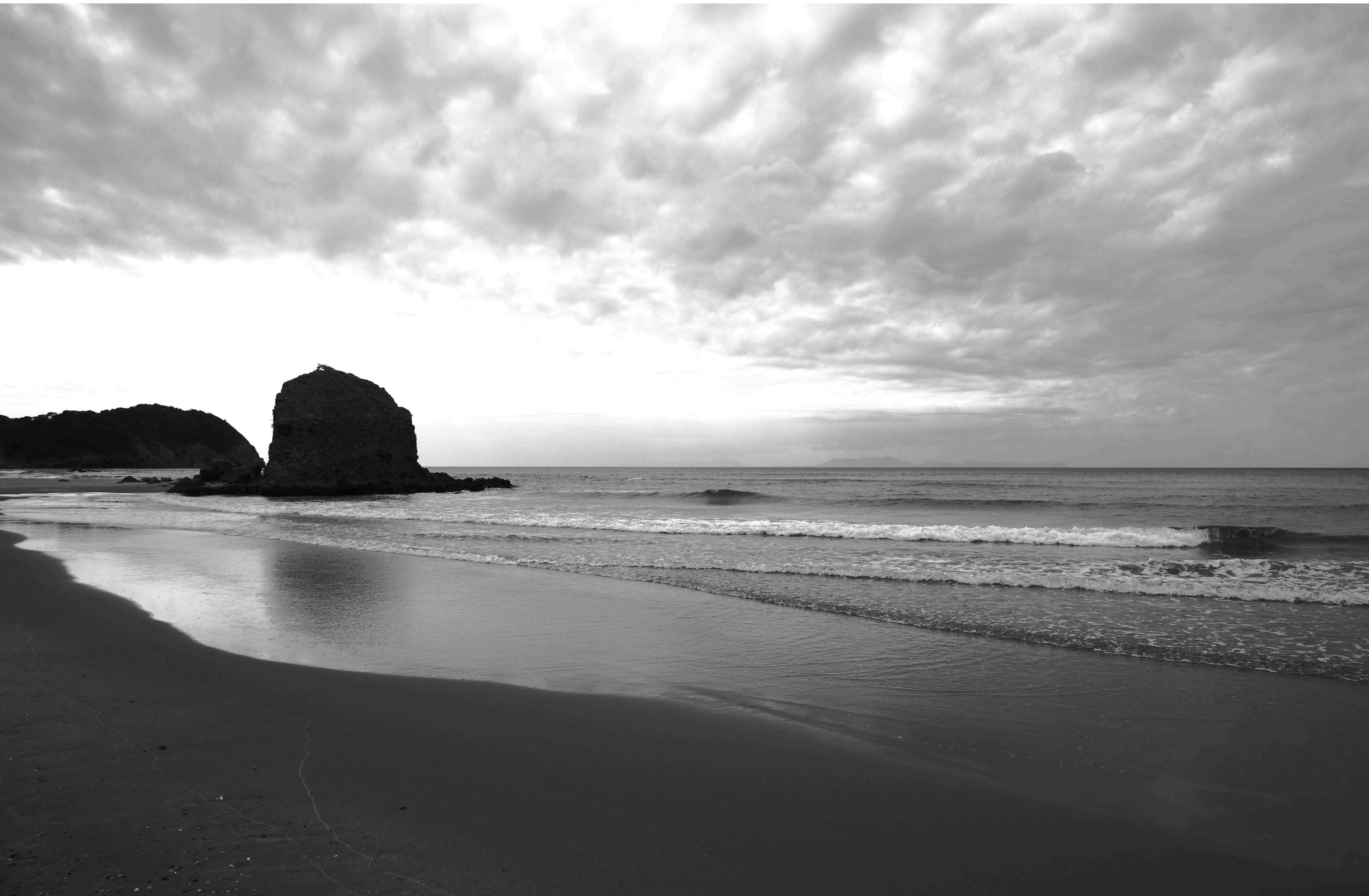
The west coast of Kagoshima is spreading East China Sea. The look is vaguely off the coast, Koshiki islands