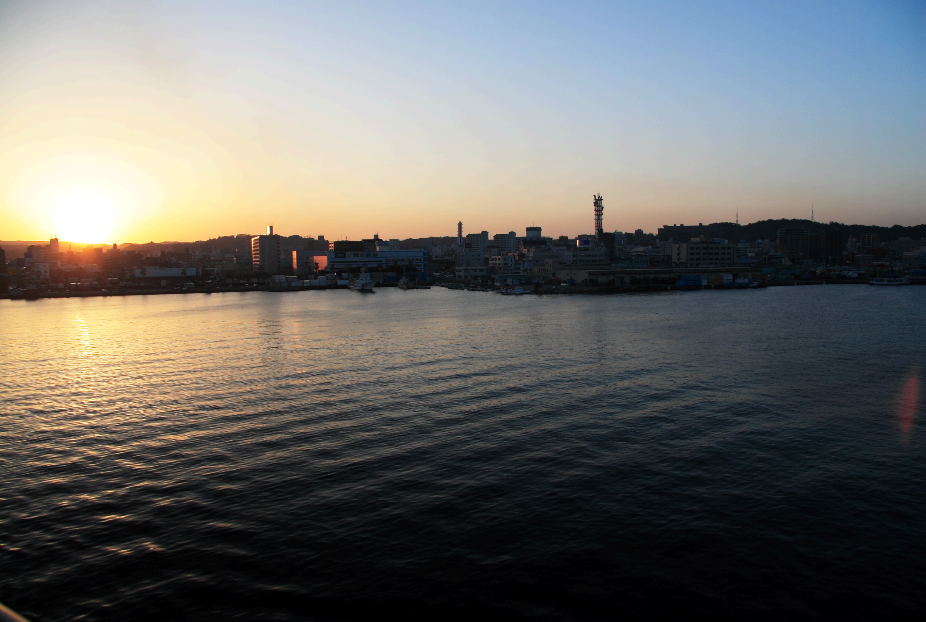
Kagoshima Bay of sunset.