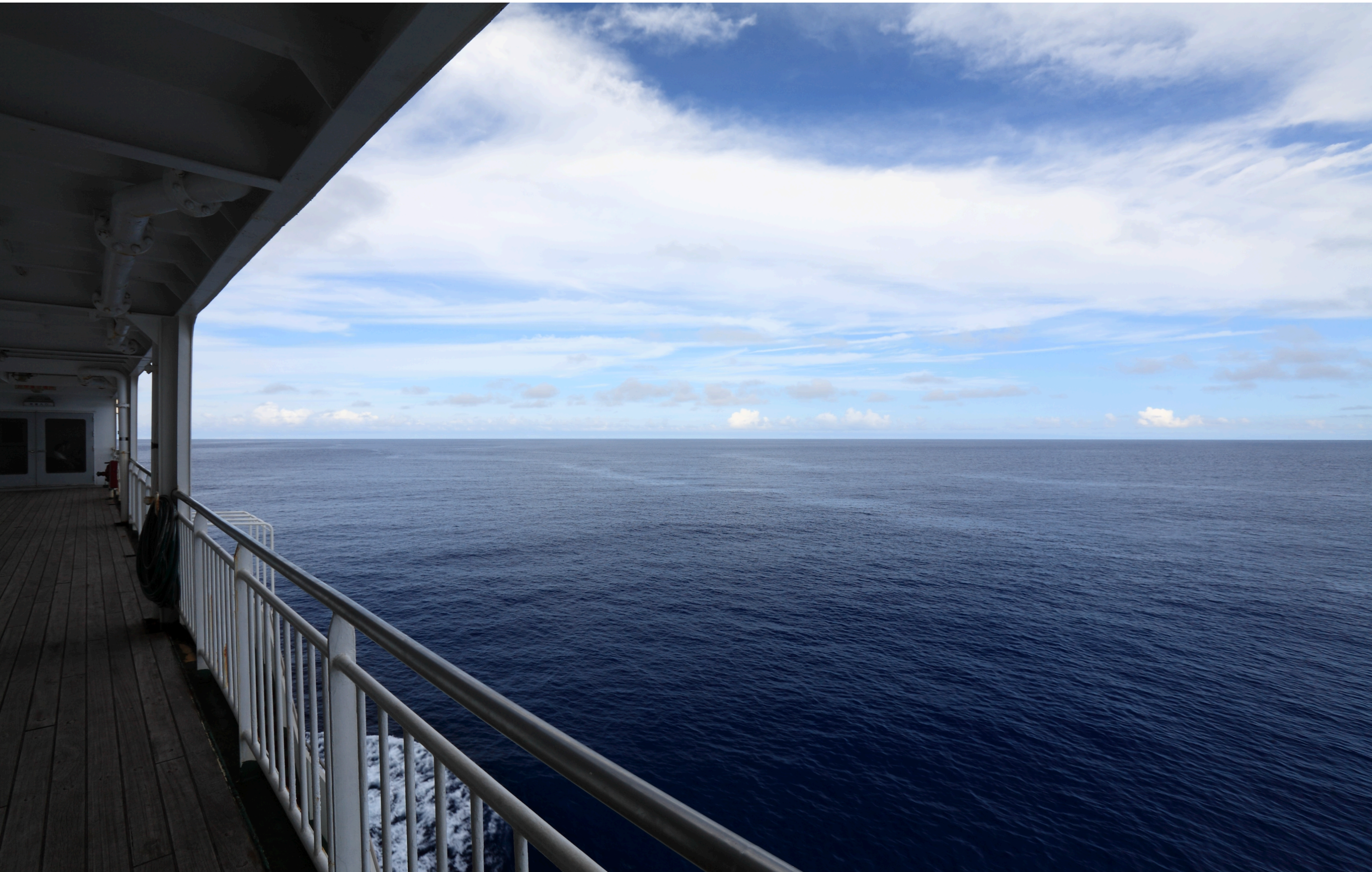
Voyage to the surrounding islands in Kagoshima is fascinating.