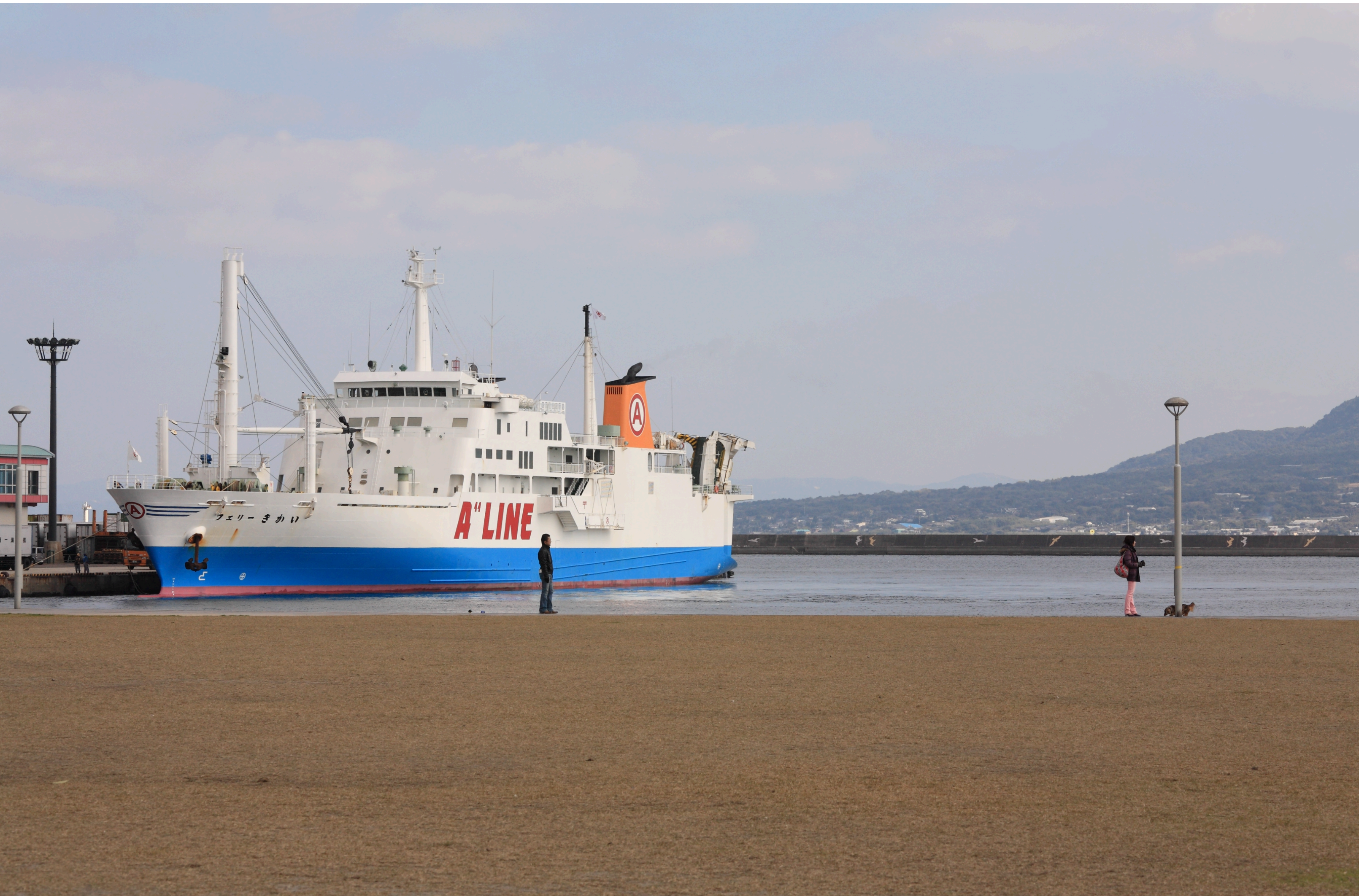
There are many ships in the Kagoshima harbor to go to the islands.