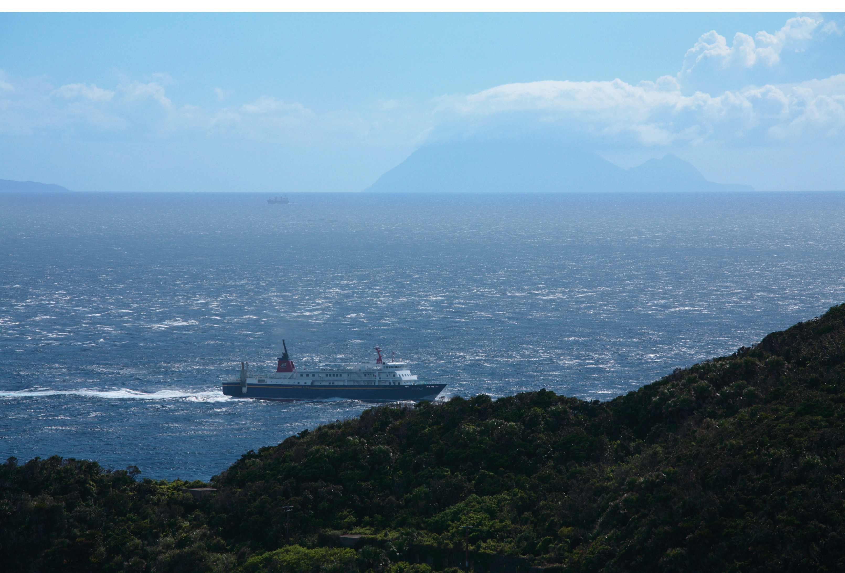
There are Sata cape to an exit of the Kagoshima bay. Beyond there are many islands.