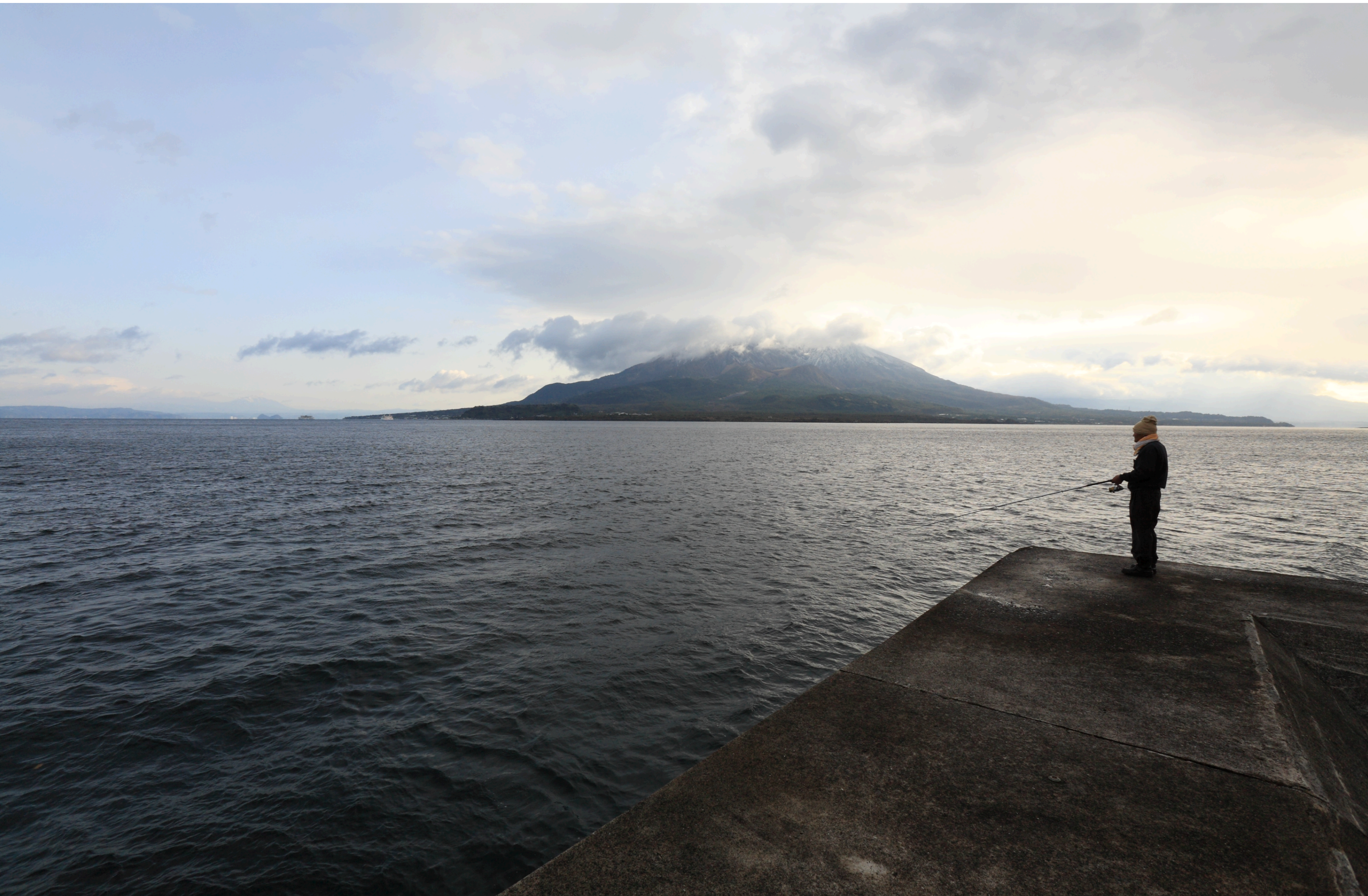
The average depth of Kagoshima Bay, 140m back portion bay, 126m Gulf portion, and the mouth is 80m. That of the entire bay is 117m. The maximum depth is 206m at the inner bay, and 237m at the central bay.